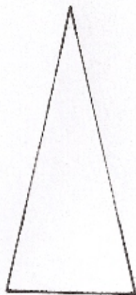
Point d'Espagne (wipped variation) stitch