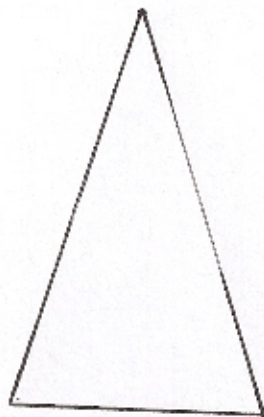
Double Brussel (corded buttonhole) stitch